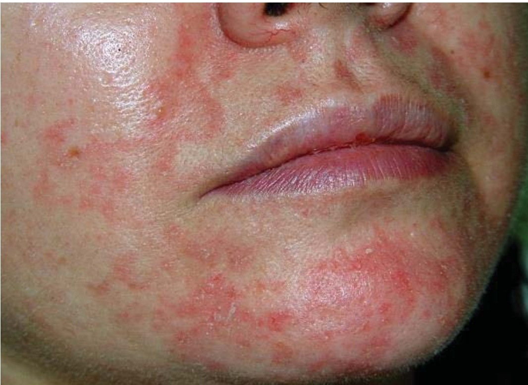
Seborrhoeic dermatitis/eczema: erythema and fine scaling. Involves nasolabial folds, excludes perioral area. May affect other areas including eyebrows and scalp.